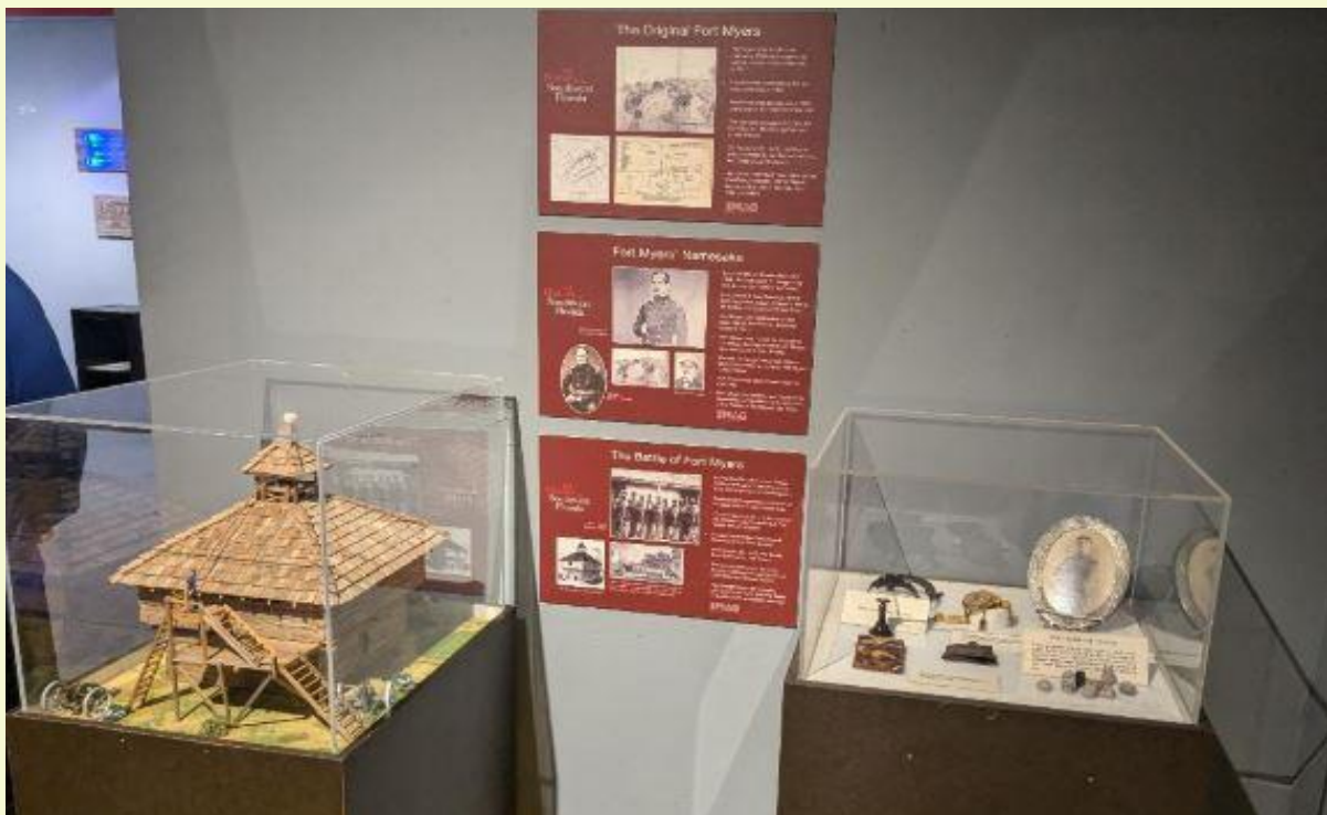
Blockhouse exhibit and artifacts recovered from the old Fort's site. Three such Blockhouses comprised the main defense of the Civil War fort.