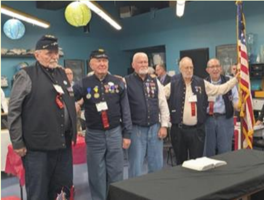
Dept. of Florida SUVCW Officers being officially sworn in