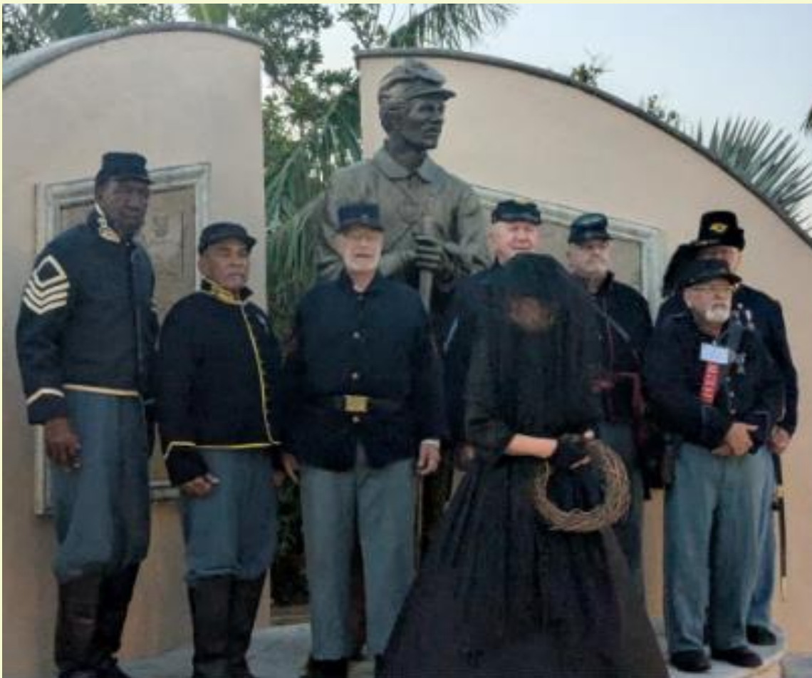
SVR Honor Guard at 2 nd U.S.C.T. Memorial in Centennial Park, Fort Myers