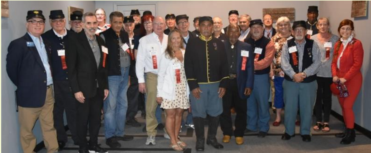
Attendees – 2025 Department of Florida SUVCW 30 th Annual Encampment