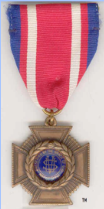
Item # 361