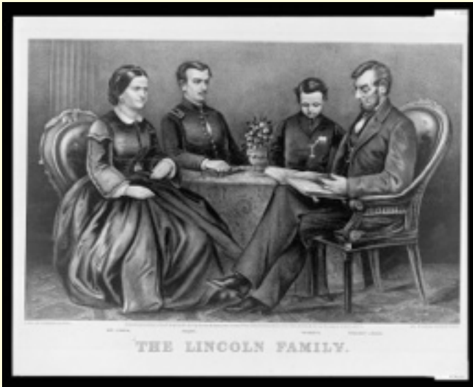
Abraham Lincoln with Mary Todd Lincoln and sons Robert and Tad (Curier & Ives lithograph, 1866)

Dept. of Florida has the following camps