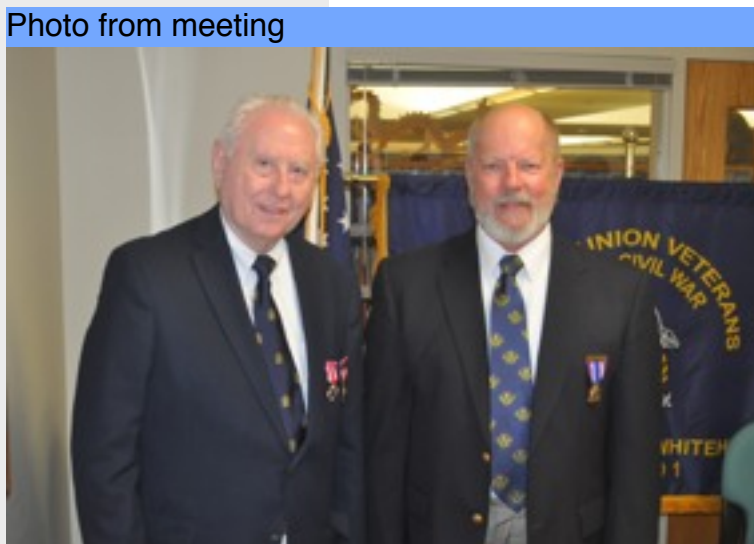
Photo from meeting